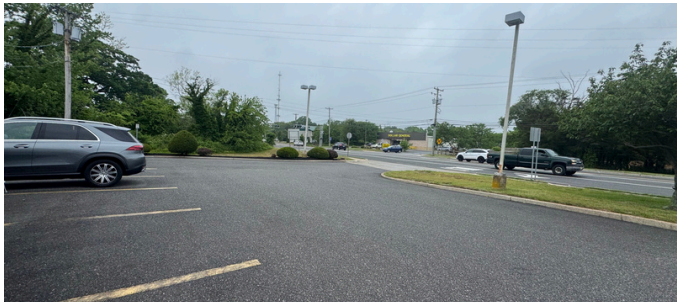
ENTRANCE/EXIT OFF INDIAN TRAIL ROAD