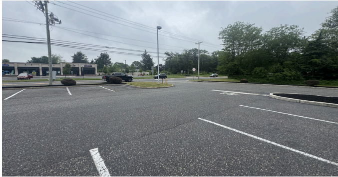
ENTRANCE/EXIT OFF ROUTE 9