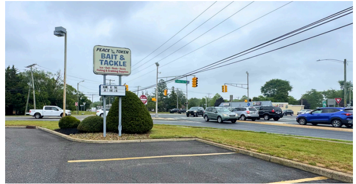
MONUMENT SIGNAGE OFF ROUTE 9