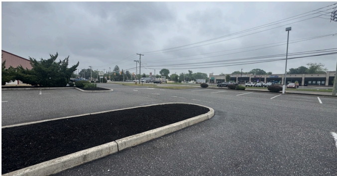
ENTRANCE ONLY OFF ROUTE 9