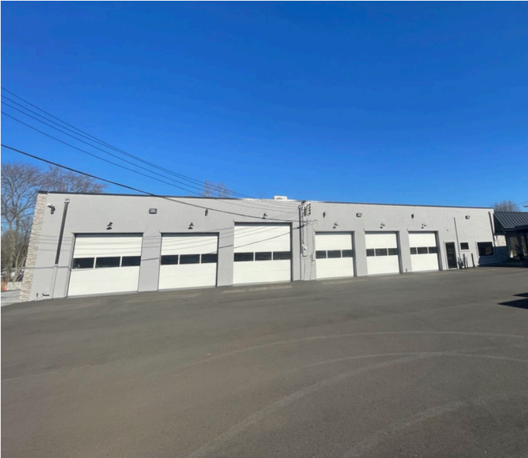
EXTERIOR - BAYS