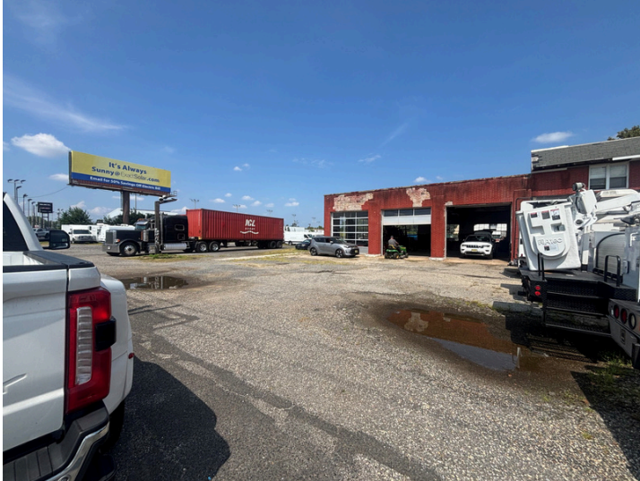
INCOME PRODUCING BILLBOARD