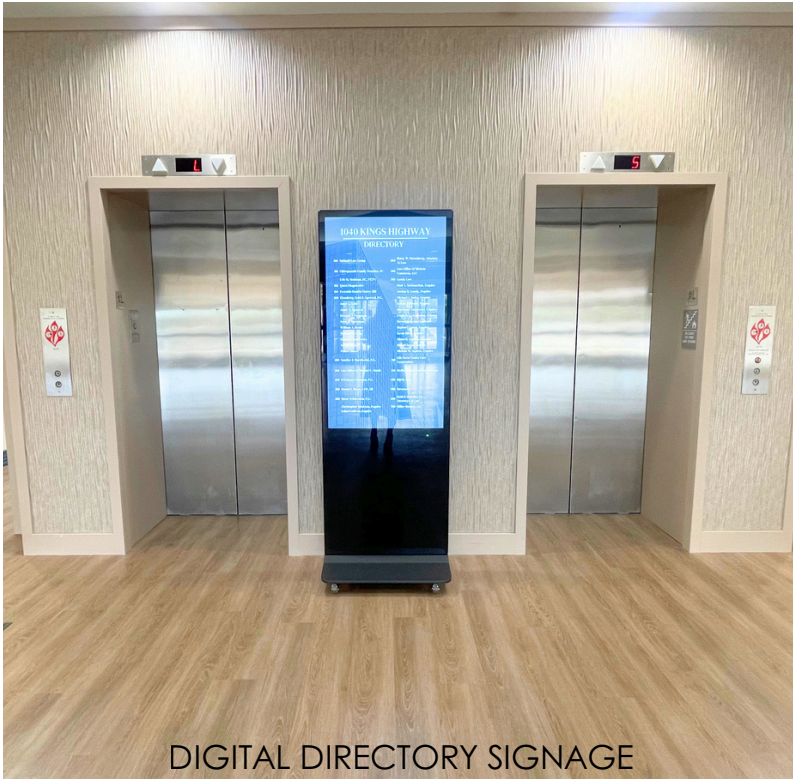
DIGITAL DIRECTORY SIGNAGE