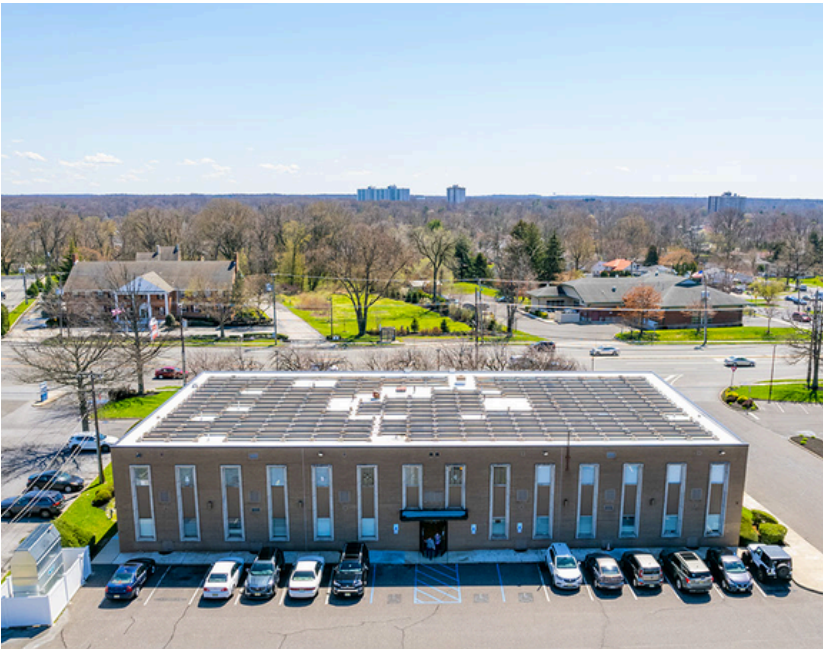
1020 N. KINGS HIGHWAY