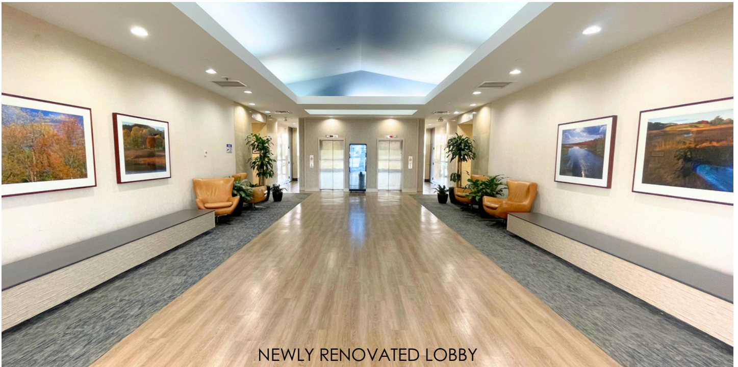
NEWLY RENOVATED LOBBY

The foregoing information was furnished to us by sources which we deem to be reliable, but no warranty or representation is made as to the accuracy thereof. Subject to correction of errors, omissions, change of price, prior sale or withdrawal from market without notice.