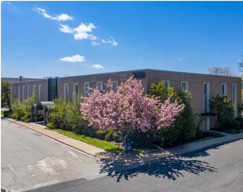
1050 N. KINGS HIGHWAY