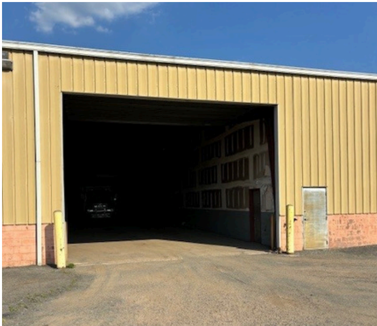
SIDE DRIVE-IN DOOR