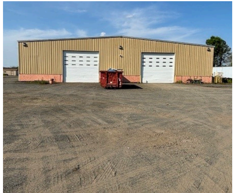
REAR DRIVE-IN DOORS

The foregoing information was furnished to us by sources which we deem to be reliable, but no warranty or representation is made as to the accuracy thereof. Subject to correction of errors, omissions, change of price, prior sale or withdrawal from market without notice.