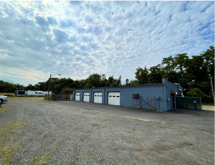
SIDE VIEW WITH 4 BAYS

The foregoing information was furnished to us by sources which we deem to be reliable, but no warranty or representation is made as to the accuracy thereof. Subject to correction of errors, omissions, change of price, prior sale or withdrawal from market without notice.