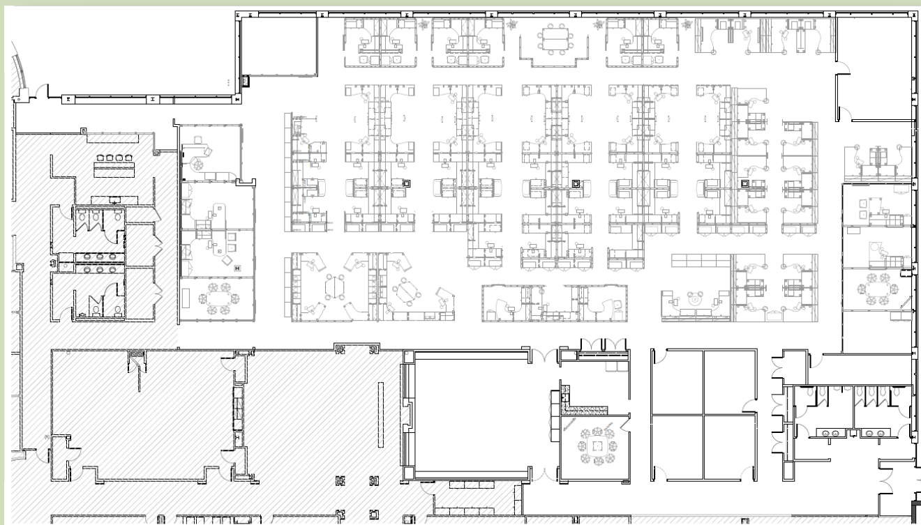
SUITE 101 18,222 SF