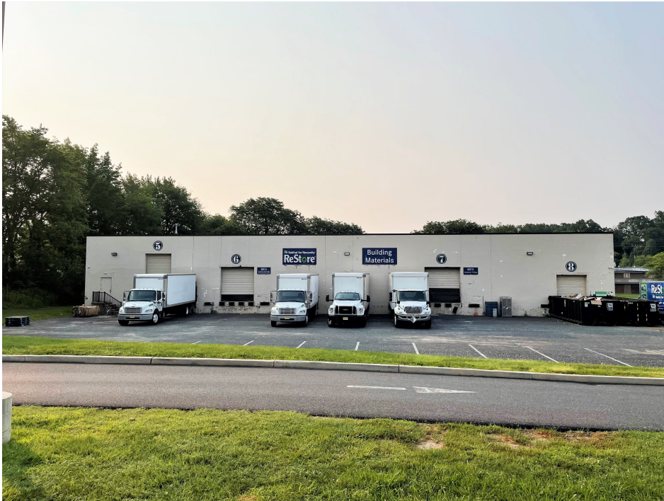
FOUR LOADING DOCKS