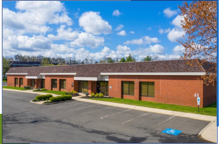
4A Eves Drive, Marlton, NJ