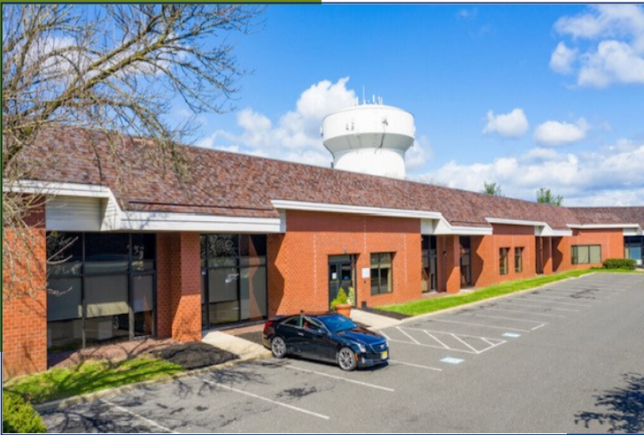
4B Eves Drive, Marlton, NJ