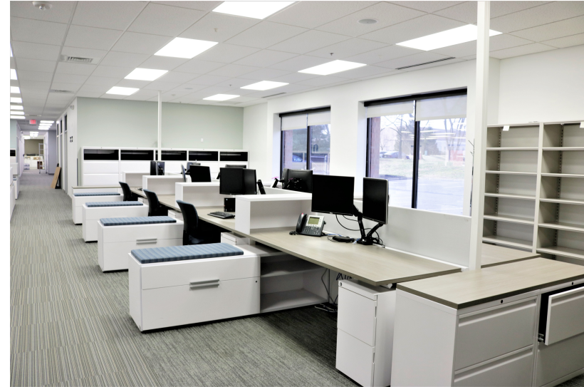
*Turn-key fully furnished space in 4B

The foregoing information was furnished to us by sources which we deem to be reliable, but no warranty or representation is made as to the accuracy thereof. Subject to correction of errors, omissions, change of price, prior sale or withdrawal from market without notice.