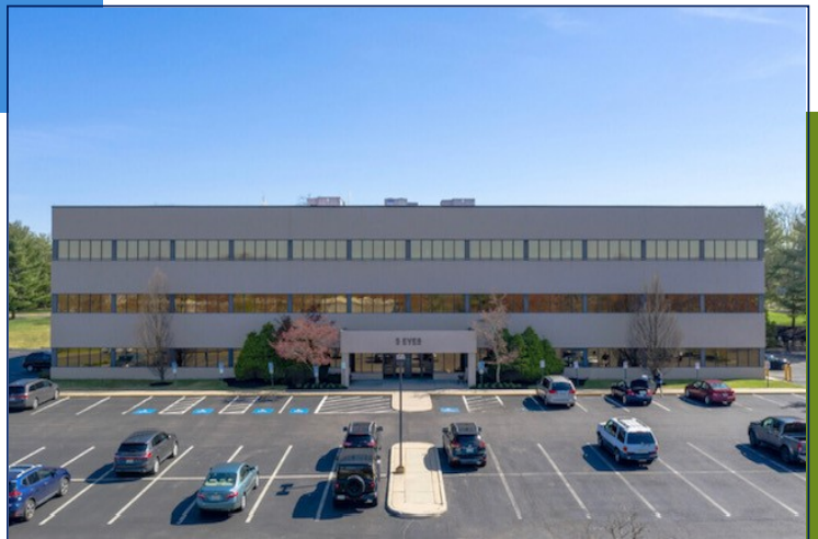
5 Eves Drive, Marlton, NJ