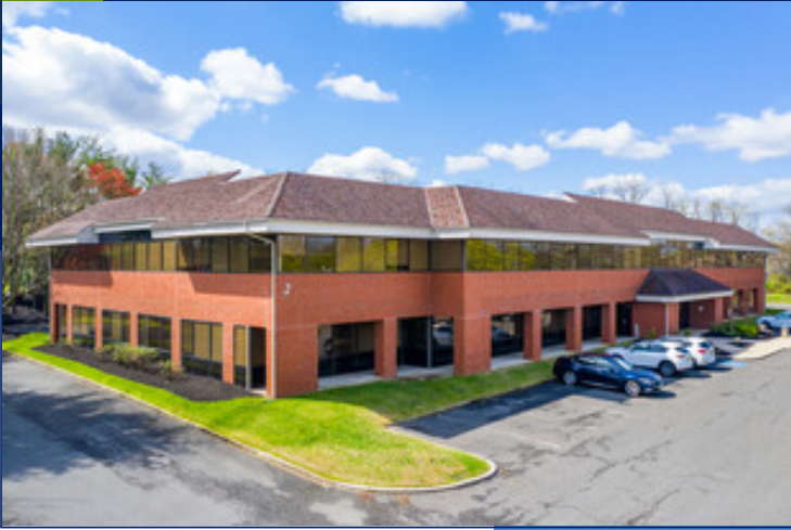
2 Eves Drive, Marlton, NJ