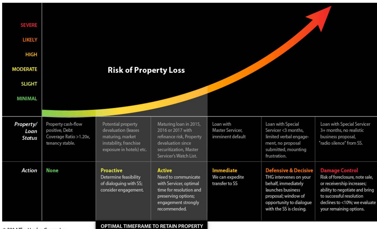
THG'S CMBS RISK PARADIGM

The moral of the story is this: when it comes to dealing with the loan on your overleveraged property, procrastination can be the main difference between success and failure. The sooner you realize that there may be an issue and pick up the phone to explore your options with a capital markets advisor, the better the chance of riding the wave to a successful resolution.