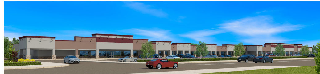
Rendering of proposed renovations