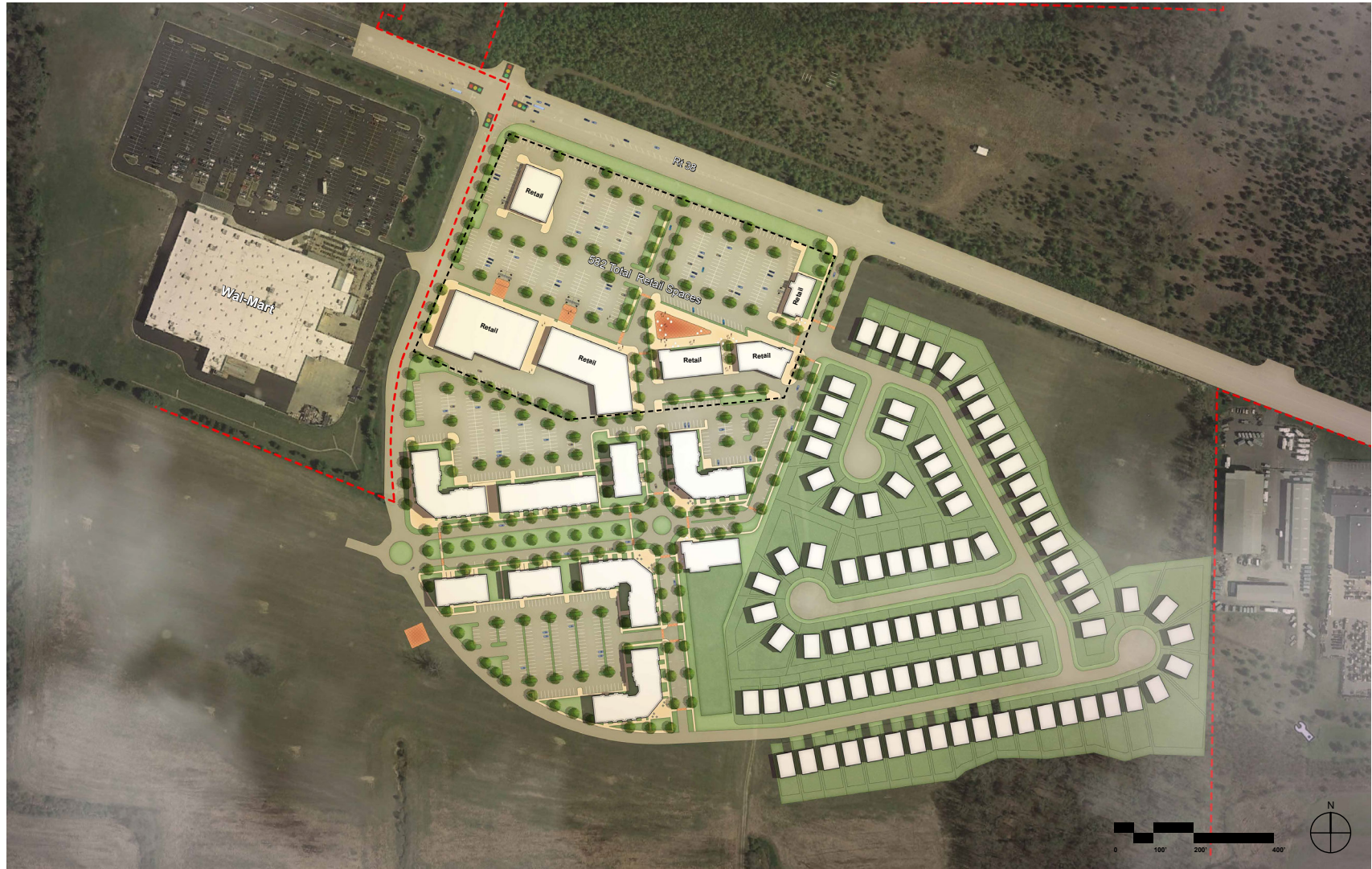
© 2017 BartonPartners Architects Planners, Inc. All rights reserved.