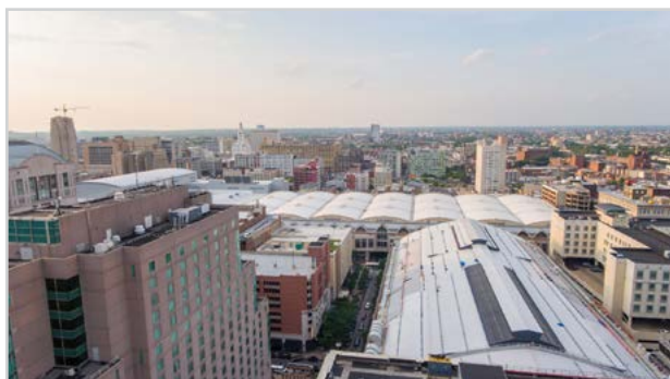
View from 1199 Ludlow looking north