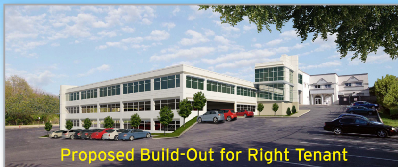
Proposed Build-Out for Right Tenant