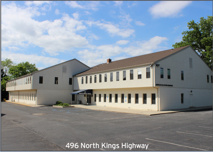
496 North Kings Highway