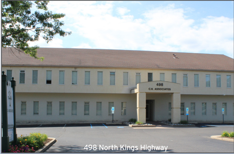
498 North Kings Highway