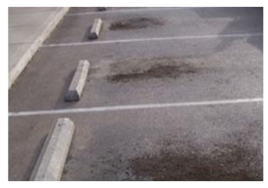
Protect against gasoline oil spills from automobiles that damage and soften the surface.