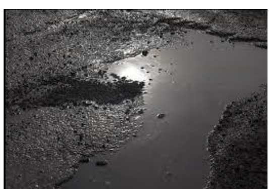
The number one destroying force to asphalt pavement is WATER.