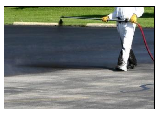
Properly applied, sealcoat can save an owner huge costs over the life of a hot mix asphalt pavement.

New asphalt surfaces that are seal coated within their first year will experience less degradation from UV damage, water and traffic.