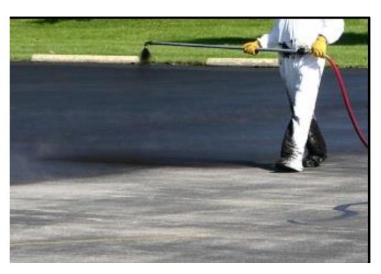
Properly applied, sealcoat can save an owner huge costs over the life of a hot mix asphalt pavement.

New asphalt surfaces that are seal coated within their first year will experience less degradation from UV damage, water and traffic.