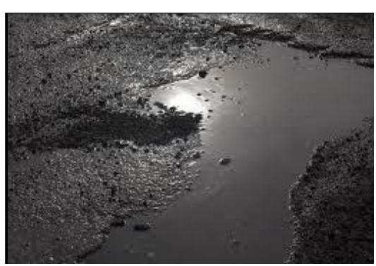
The number one destroying force to asphalt pavement is WATER.