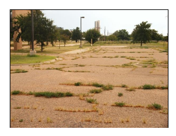
52% of consumers have avoided a business altogether because it looked dirty from the outside.