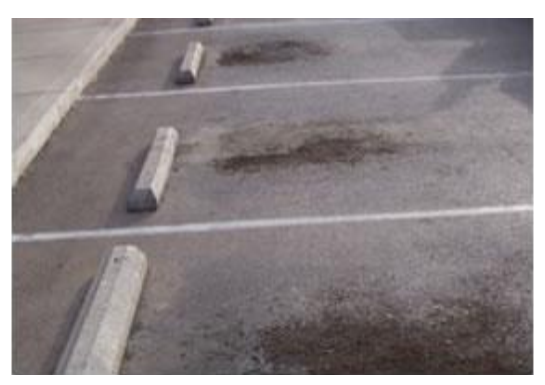
Protect against gasoline oil spills from automobiles that damage and soften the surface.