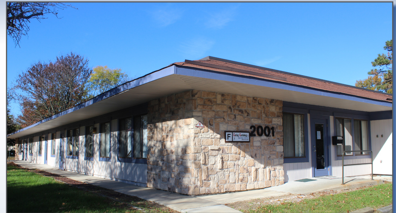
2001 Lincoln Drive West