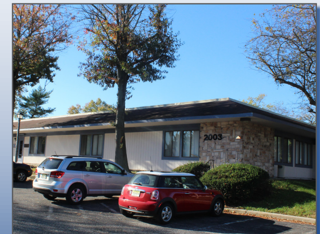
2003 Lincoln Drive West