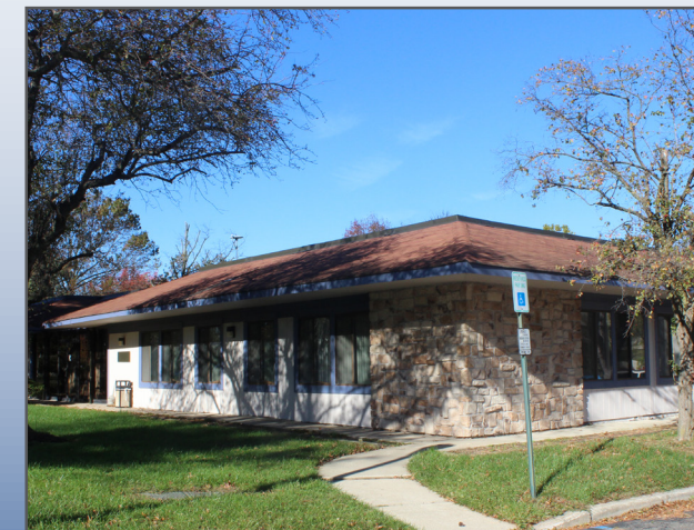
2002 Lincoln Drive West