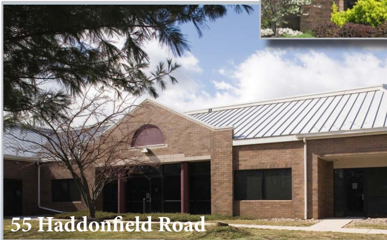
55 Haddonfield Road