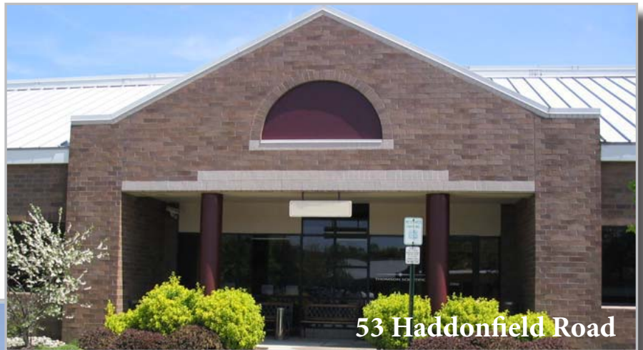
53 Haddonfield Road