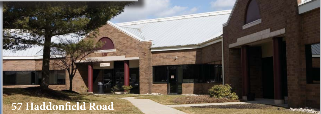
57 Haddonfield Road