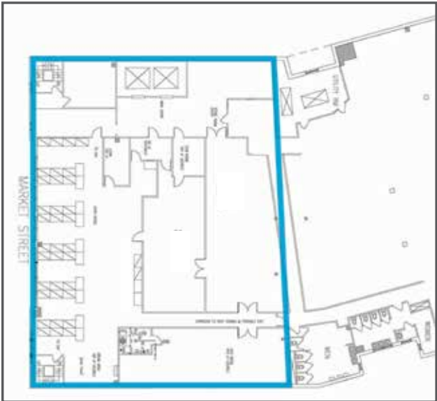
3rd Floor: 6,600 sf