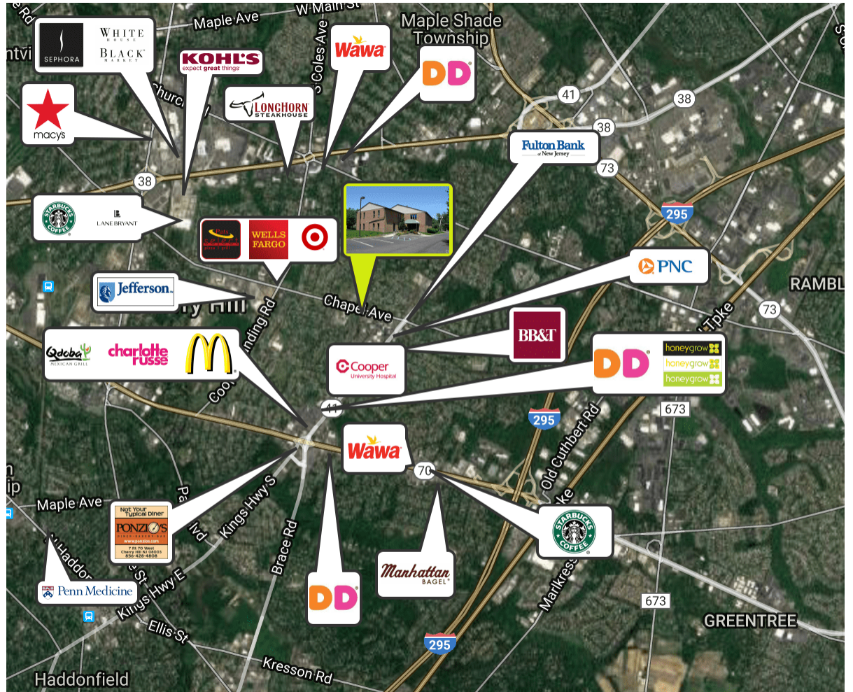
Map data ©2018 Google Imagery ©2018 DigitalGlobe, Landsat / Copernicus, U.S. Geological Survey, USDA Farm Service Agency